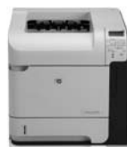
HP LaserJet P4515n Printer

HP's fastest monochrome LaserJet printer combines high-productivity printing with robust security features for exceptional performance.