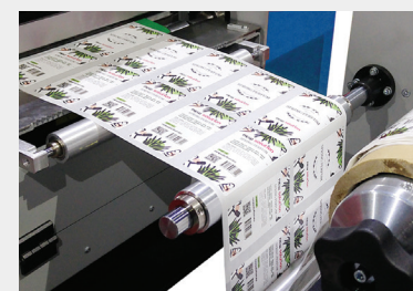
Take up for roll-to-roll printing. Single page cutting for productions on separate sheets.