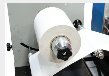
Feeder up to 9.84" for blank or pre die-cut media.