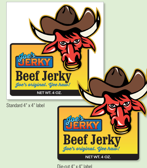
Standard 4" x 4" label