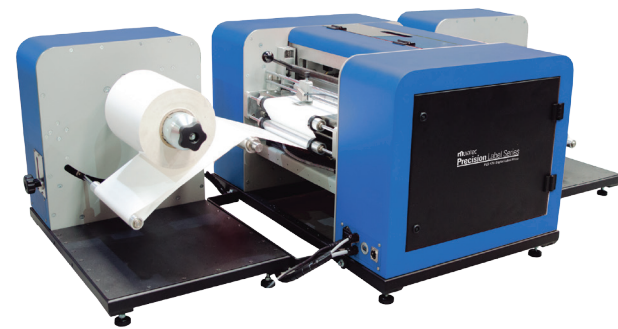
PLS-475i Digital Label Press