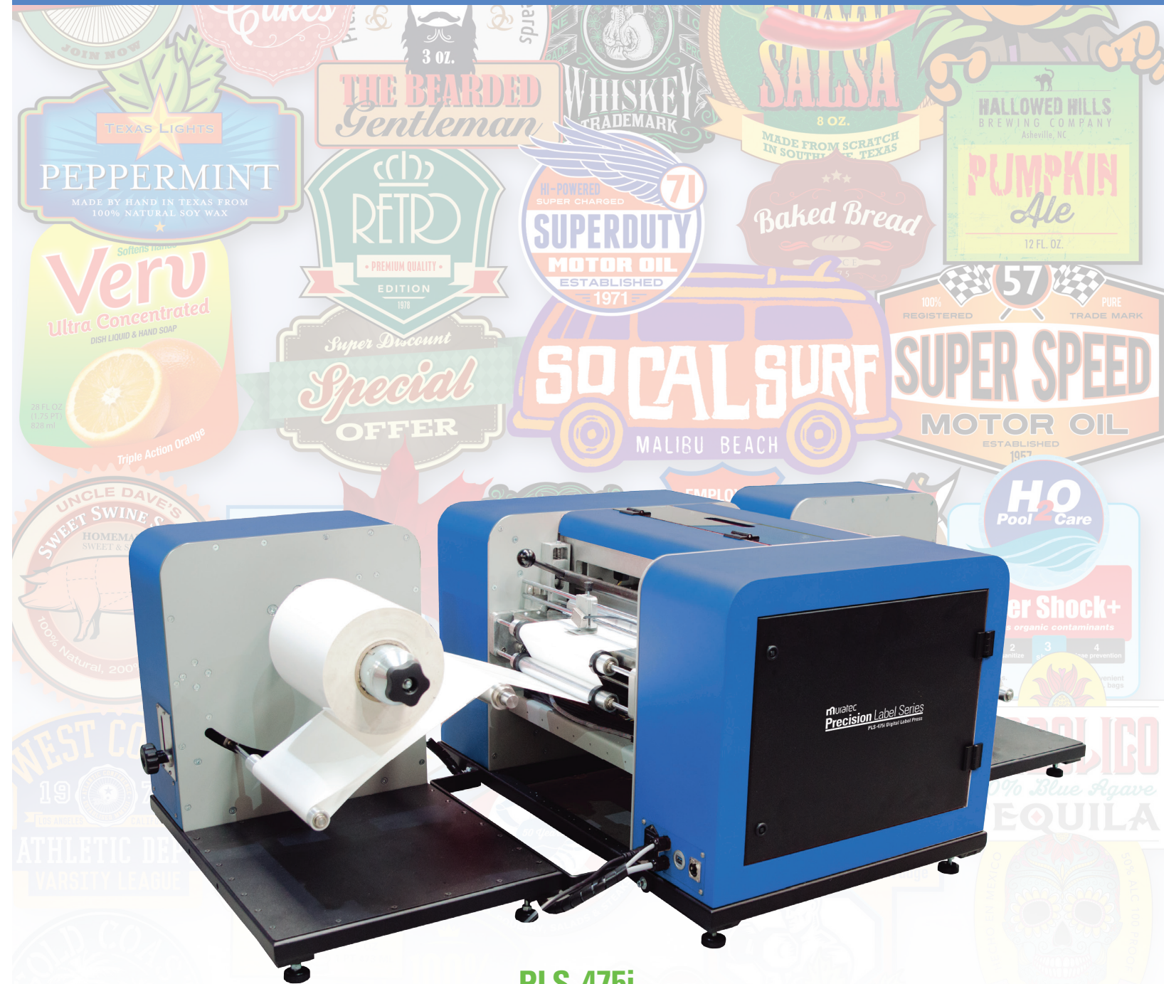
PLS-475i Digital Label Press