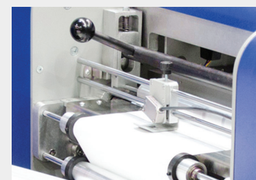
Light sensor reads pre die-cut media.