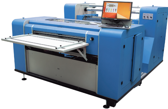
PKG-675i + PKG-675L Digital Packaging Printer + Packaging Laminator