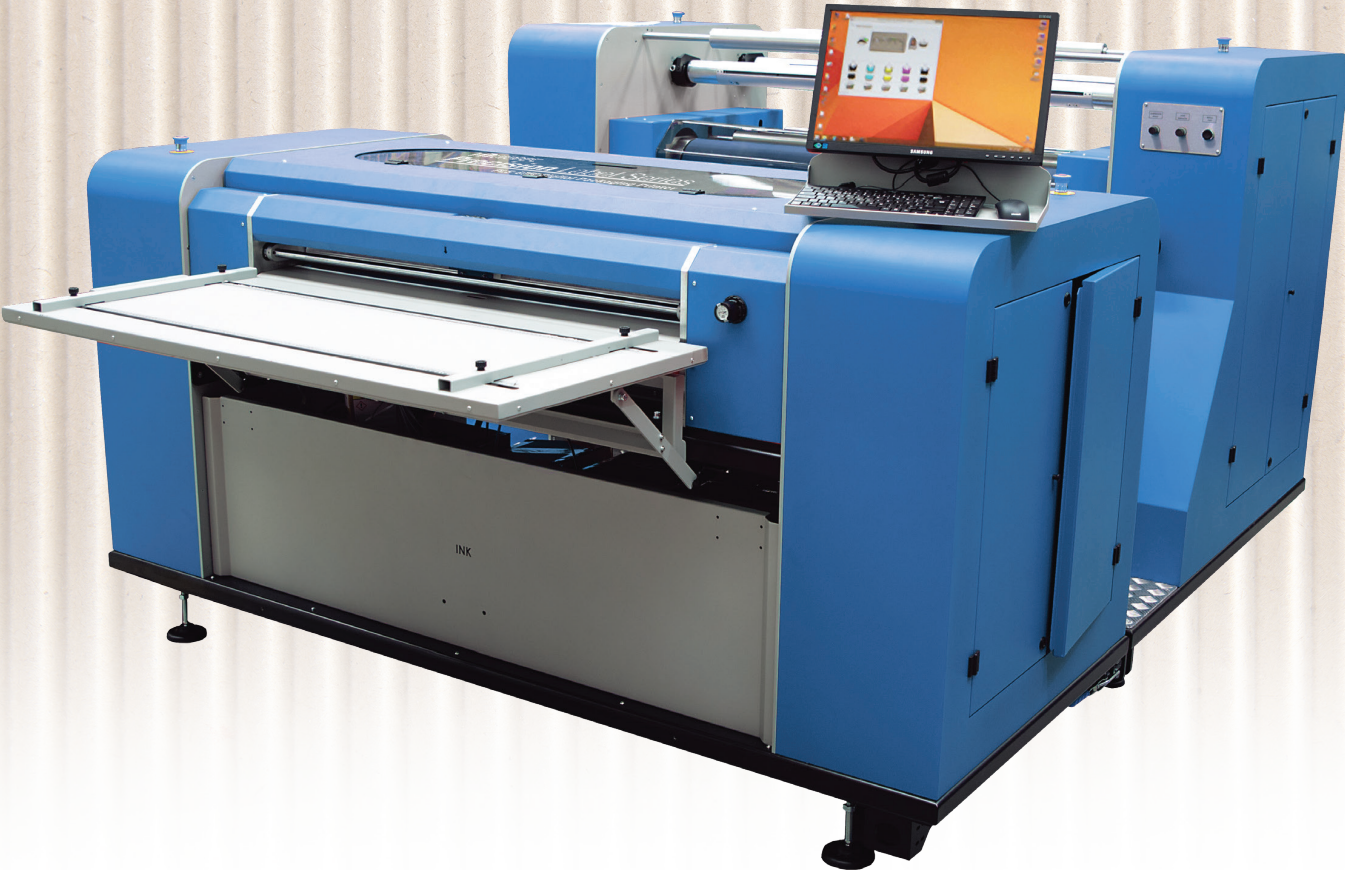
PKG-675i + PKG-675L Digital Packaging Printer + Packaging Laminator