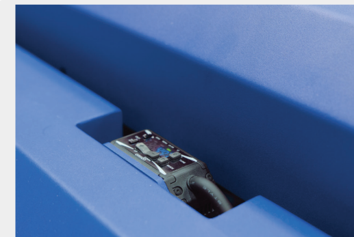
Sensors measure media thickness while print heads automatically adjust.