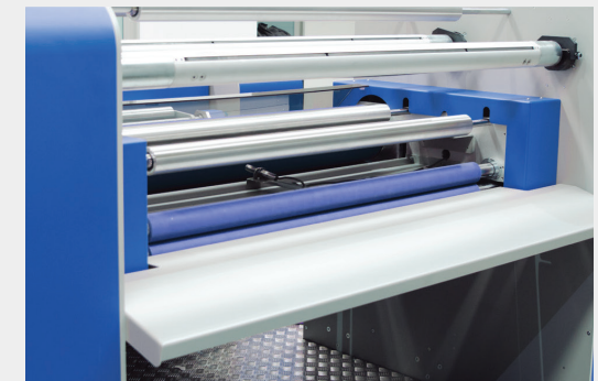
Sensors control lamination temperature to ensure the best results.