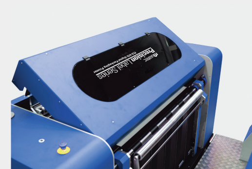
Both modules are easily accessible for maintenance.